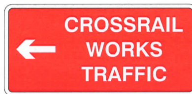
Sign ref. J