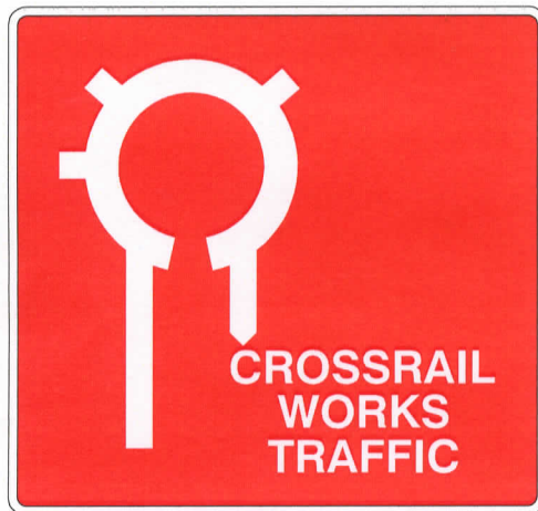
Sign ref. G