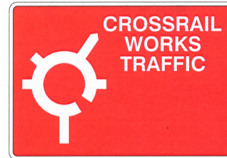
Sign ref. H