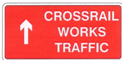
Sign ref. I