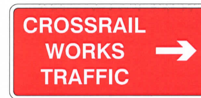
Sign ref. K