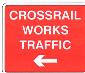
Sign ref. J Alternative

Modified version of sign J, with direction arrow placed below legend. this is only suitable in locations where footway width restrictions prevents used of the standard layout