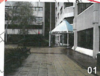
The Victoria Entertainments Centre