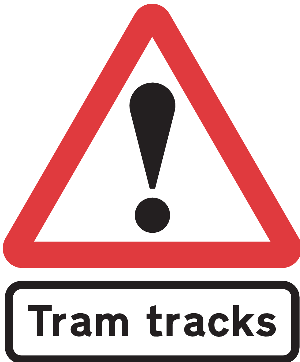
Illustration of warning sign and associated supplementary plate as stated in para 1 of the Authoristion.