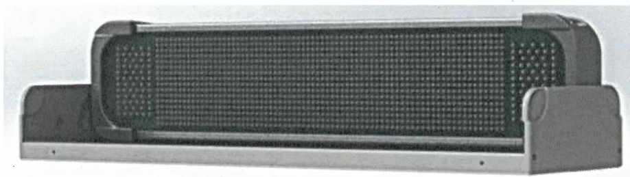
*Motorised tip up or tip down shown above